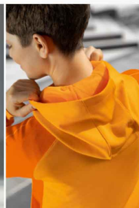
HIGH COLLAR WITH HOOD