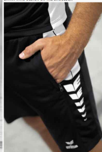
ZIP POCKETS AT THE SIDE