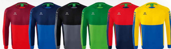
1072201 red/orange 1072202 new royal/new navy 1072203 slate grey/black 1072204 green/emerald 1072205 new navy/red 1072206 new royal/yellow

Kids: Size 128-164 EUR 49,99* Adults: Size S-XXXL EUR 54,99*