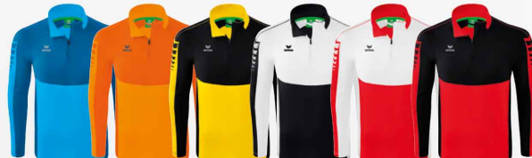
1262207 curacao/mykonos 1262208 new orange/orange 1262209 yellow/black 1262210 black/white 1262211 red/white 1262212 red/black