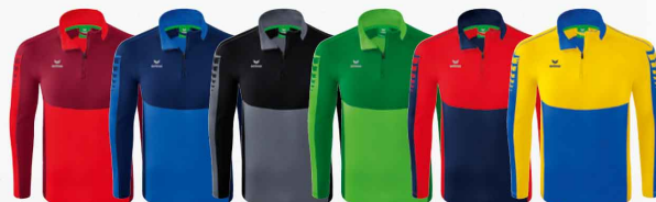
1262201 red/orange 1262202 new royal/new navy 1262203 slate grey/black 1262204 green/emerald 1262205 new navy/red 1262206 new royal/yellow