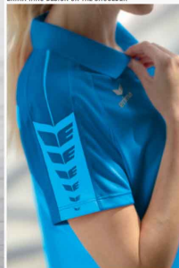
RIBBED POLO-SHIRT COLLAR WITH BUTTONS