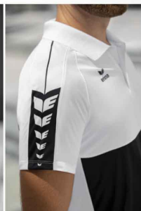
ERIMA WING DESIGN ON THE SHOULDER