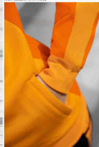
ZIP POCKETS AT THE SIDE