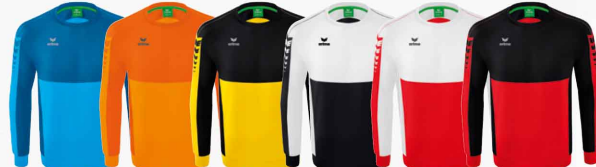
1072207 curacao/mykonos 1072208 new orange/orange 1072209 yellow/black 1072210 black/white 1072211 red/white 1072225 red/black