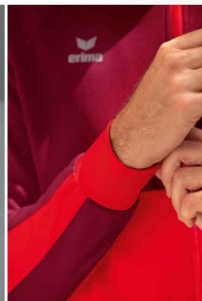
WIDE RIBBED TRIM ON SLEEVES AND HEM