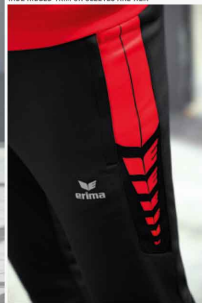
ERIMA WING DESIGN AT THE TOP ALONG THE SIDE