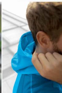
HIGH COLLAR WITH HOOD