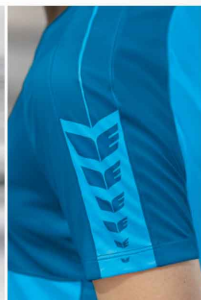
ERIMA WING DESIGN ON THE SHOULDER