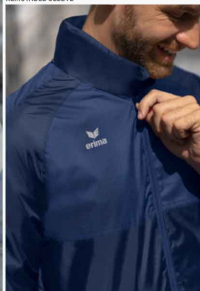
WATERPROOF OUTER MATERIAL WITH WELDED MAIN SEAMS