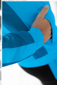
ZIP POCKETS AT THE SIDE