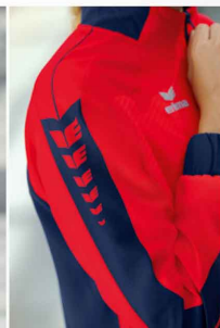
ERIMA WING DESIGN ON THE SHOULDER