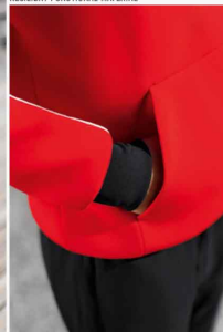
INTEGRATED FRONT POUCH POCKET