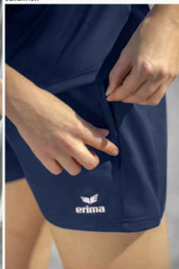
ZIP POCKETS AT THE SIDE