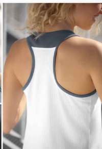
BACK MADE FROM MESH MATERIAL FOR IDEAL BODY TEMPERATURE