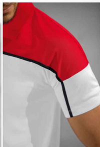
LIGHT, QUICK-DRYING FUNCTIONAL MATERIAL FOR A DRY SENSATION