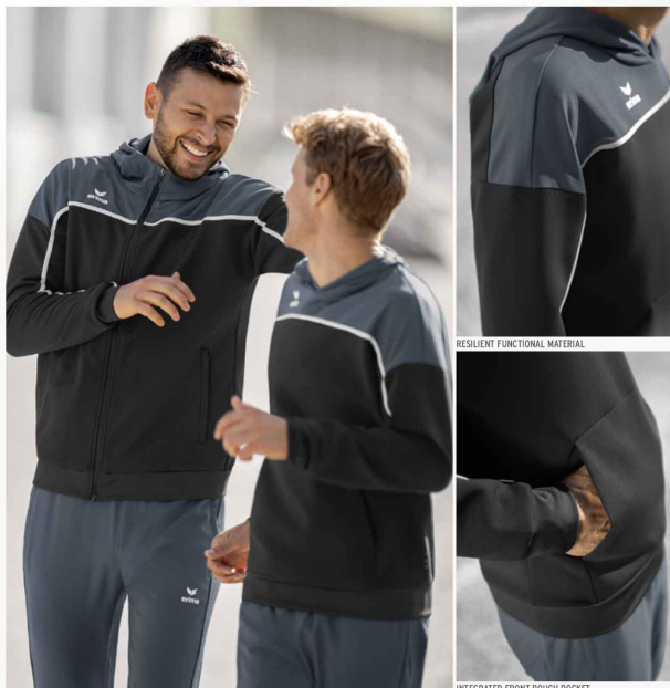
RESILIENT FUNCTIONAL MATERIAL