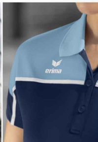
LIGHT, QUICK-DRYING FUNCTIONAL MATERIAL FOR A DRY SENSATION