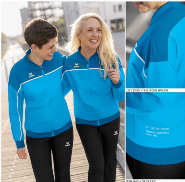
LIGHT, STRETCHY FUNCTIONAL MATERIAL

GET TOGETHER AND WIN PREMIUM SPORTSWEAR SINCE 1900.