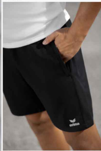
ZIP POCKETS AT THE SIDE