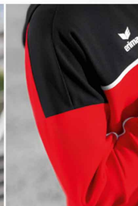
RESILIENT FUNCTIONAL MATERIAL